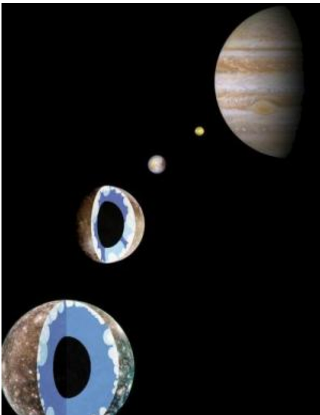
Jupiter (right) and the Galilean satellites (right to left) Io,

Instead of carrying a transmitter onboard a spacecraft to overpower Jupiter's radio signals, researchers now suggest using the giant planet's decametric radio waves to scan its moons.