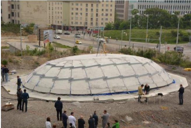
The completed "inflated" concrete dome.

A completely new way of building concrete structures has been developed: Scientists at the Vienna University of Technology bend concrete with an air cushion, making complicated timber structures obsolete. The new method has now been published, an experimental concrete dome has been presented in Vienna.