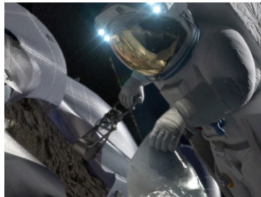
Conceptual image of an astronaut retrieving a sample from a captured asteroid.

Before taking the plunge and attempting to send people to Mars, and the associated dangers of deep space , NASA plans to use the Moon as an intermediate proving ground, because it is close enough to return astronauts home within a couple of days.