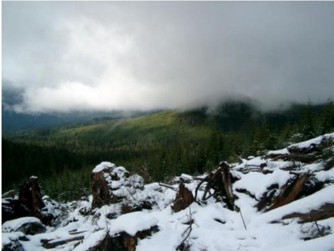
Glaciers along the Continental Divide, Alberta, May 2007. Glacier- and snow-fed systems provide the backbone of water supply not only in Western Canada but also in many other regions in the world.

New research has shown for the first time that the amount of water flowing through rivers in snow-affected regions depends significantly on how much of the precipitation falls as snowfall. This means in a warming climate, if less of the precipitation falls as snow, rivers will discharge less water than they currently do.