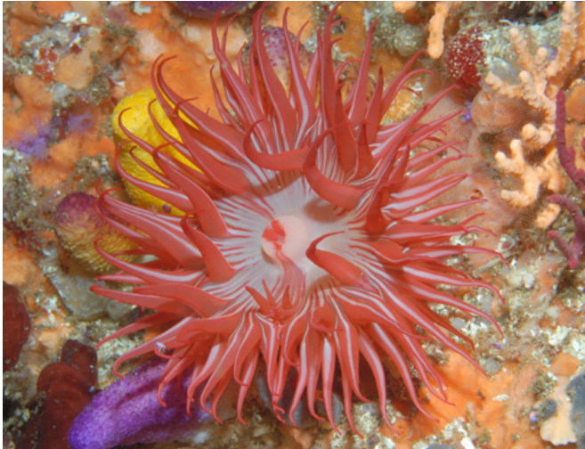
This sea anemone, Actiniidae sp., was photographed in Algoa Bay, Port Elizabeth, South Africa.

A deep-water creature once thought to be one of the world's largest sea anemones, with tentacles reaching more than 6.5 feet long, actually belongs to a new order of animals. The finding is part of a new DNA-based study led by the American Museum of Natural History that presents the first tree of life for sea anemones, a group that includes more than 1,200 species. The report, which is published today in the journal PLOS ONE , reshapes scientists' understanding of the relationships among these poorly understood animals.