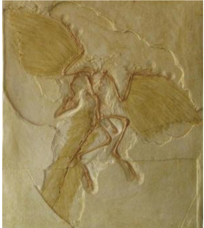
Archaeopteryx, the first bird, was a small dinosaur weighing only 1 kg. Small size might have been key to the evolutionary success of birds.

'What we found was striking. Dinosaur body size evolved very rapidly in early forms, likely associated with the invasion of new ecological niches. In general, rates slowed down as these lineages continued to diversify,' said Dr David Evans at the Royal Ontario Museum, who co-devised the project. 'But it's the sustained high rates of evolution in the feathered maniraptoran dinosaur lineage that led to birds – the second great evolutionary radiation of dinosaurs.'