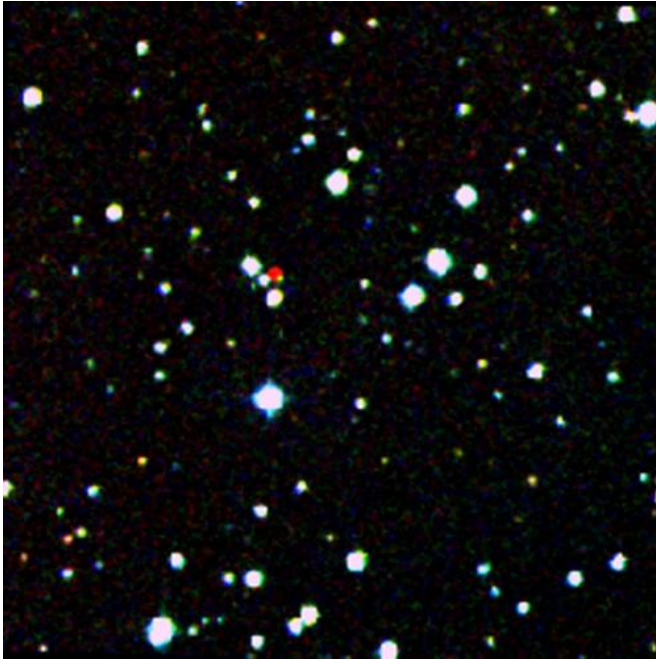
A nearby star stands out in red in this image from the Second Generation Digitized Sky Survey.

(Phys.org) —After searching hundreds of millions of objects across our sky, NASA's Wide-Field Infrared Survey Explorer (WISE) has turned up no evidence of the hypothesized celestial body in our solar system commonly dubbed "Planet X."