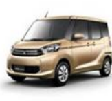
Mitsubishi eK Space