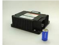
Panasonic's 12V Energy Recovery System (back) and Ni-MH battery cell used in the system (front)

Panasonic Corporation today announced that its 12V Energy Recovery Systems that use nickel metal hydride (Ni-MH) batteries are installed in the new idle-stop vehicles just rolled out by Nissan Motor Co., Ltd. and Mitsubishi Motors Corporation, the Nissan DAYZ ROOX and Mitsubishi eK Space. The new models were designed and developed for the Japanese market by NMKV Co., Ltd., a joint venture formed by the two automakers.