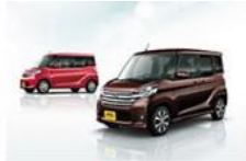
Nissan DAYZ ROOX