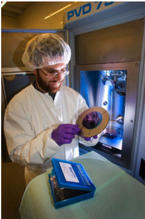
Nanotechnology research.

Nanoparticles—or nanomaterials, as they are often called—are chemical objects with dimensions in the range of 1-100 nanometres (nm).