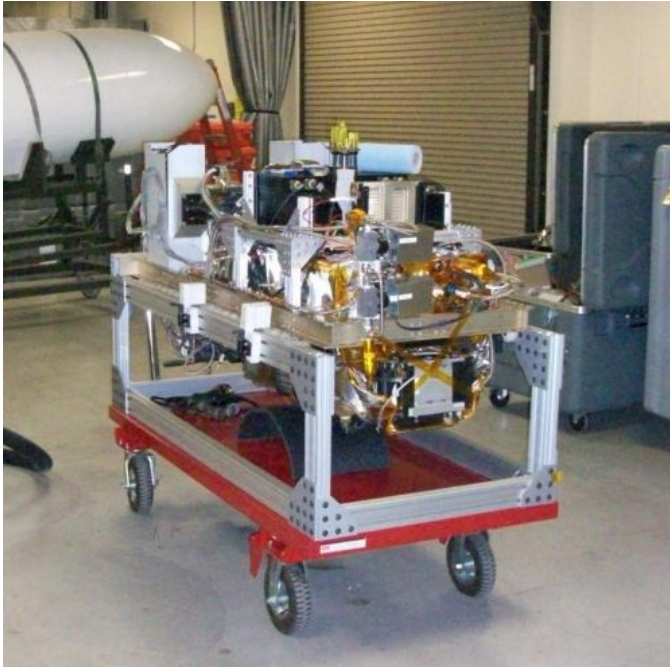
MABEL, short for "Multiple Altimeter Beam Experimental Lidar," serves as an ICESat-2 simulator.