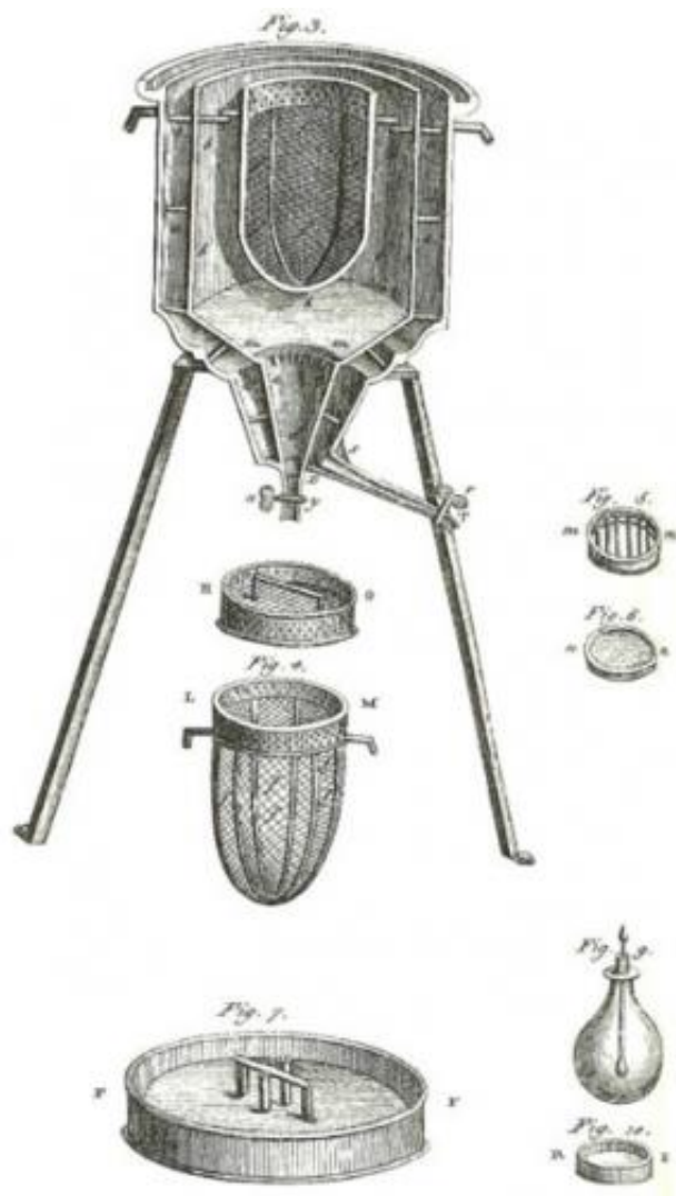
Ice-calorimeter from Antoine Lavoisier's 1789 Elements of Chemistry.

This is a key aspect of scientific theories. If you want to replace a robust scientific theory with a new one, the new theory must be able to do more than the old one. When you replace the old theory you now understand the limits of that theory and how to move beyond it.