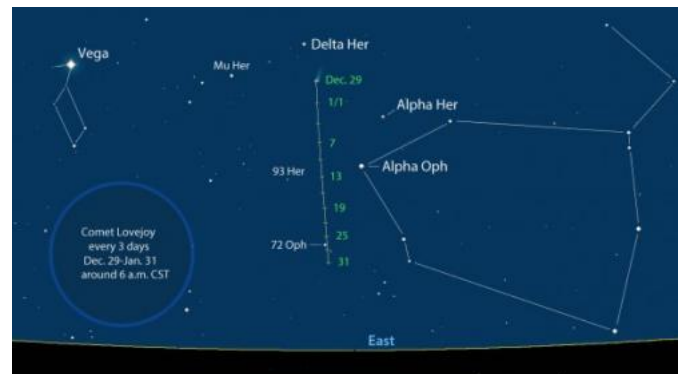
Track of Comet C/2013 R1 Lovejoy in the morning sky marked at 3-day intervals shortly before the start of dawn (6 a.m. local time) tomorrow through Jan. 31. Stars shown for Dec. 29 to magnitude 5.8. Her = Hercules and Oph = Ophiuchus. Click to enlarge. Created with Chris Marriott's SkyMap software

Looking ahead to 2014 there are at present three comets beside Lovejoy that are expected to wax bright enough to see in binoculars and possibly with the naked eye: C/2012 K1 PanSTARRS, C/2013 V5 Oukaimeden and C/2013 A1 Siding Spring The first lurks in Hercules but come early April should bulk up to magnitude 9.5, bright enough to track in a small telescope for northern hemisphere observers. Watch K1 PANSTARRS amble from Bootes across the Big Dipper and down through Leo from mid-spring through late June hitting magnitude 7.5 before disappearing in the summer twilight glow. K1 will be your go-to comet during convenient viewing hours.