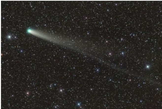
Comet C/2013 R1 Lovejoy starts the new year as the brightest comet in the sky at around magnitude 6. In this photo taken on Dec. 31, two tails are visible. The longer one is the ion or gas tail; the broader pale yellow fan is the dust tail.

As 2014 opens, most of the half dozen comets traversing the morning and evening sky are faint and require detailed charts and a good-sized telescope to see and appreciate. Except for Comet Lovejoy. This gift to beginner and amateur astronomers alike keeps on giving. But wait, there's more. Three additional binocular-bright comets will keep us busy starting this spring.