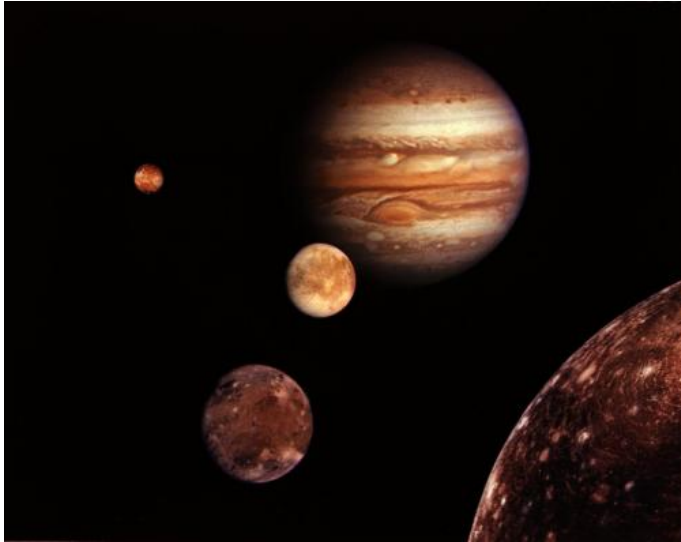
Montage showing the 4 great moons of Jupiter: Io, Europa, Ganymede and Callisto.

Worth and her colleagues analyzed where batches of several thousand rocks traveled once ejected off both Earth and Mars. "We ended up simulating over 100,000 individual fragments," Worth said.