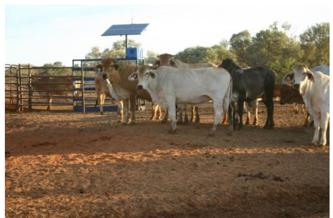
Research Site for CRC-REP Precision Pastoral Management Tools project; Glenflorrie, WA.