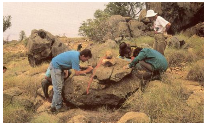
This shows richly fossiliferous freshwater limestones in the Riversleigh World Heritage Area.