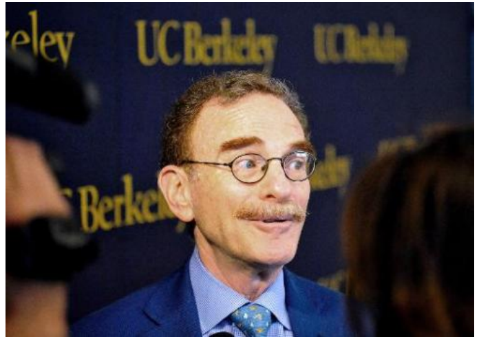
Randy Schekman, at a press conference at the University of California, Berkeley, is the co-winner of the 2013 Nobel Prize for Medicine, October 7, 2013

"It seems to me there is a significant increasingly vocal percentage of the population that thinks we shouldn't go after truth and truth is not important. And so that worries the hell out me," said Suedhof, who is an American citizen.