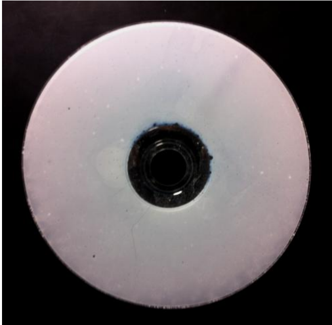
This image shows an optical disk entirely coated with zinc oxide nanorods.

Audio CDs, all the rage in the '90s, seem increasingly obsolete in a world of MP3 files and iPods, leaving many music lovers with the question of what to do with their extensive compact disk collections. While you could turn your old disks into a work of avant-garde art, researchers in Taiwan have come up with a more practical application: breaking down sewage. The team will present its new wastewater treatment device at the Optical Society's (OSA) Annual Meeting, Frontiers in Optics (FiO) 2013, being held Oct. 6-10 in Orlando, Fla.