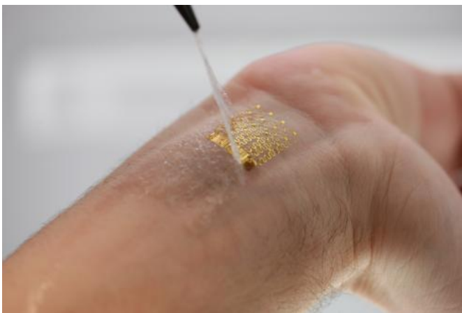
An ultrathin device for mapping changes in skin temperature to 0.02 °C is applied to the skin using a water-soluble backing. Credit: University of Illinois and