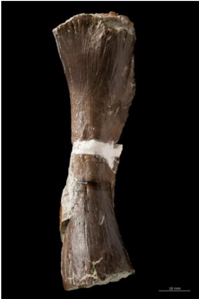
This is the femur of Metoposaurus diagnosticus krasiejowensis as viewed from behind (posterior). The sectioned plane is marked by the white stripe.