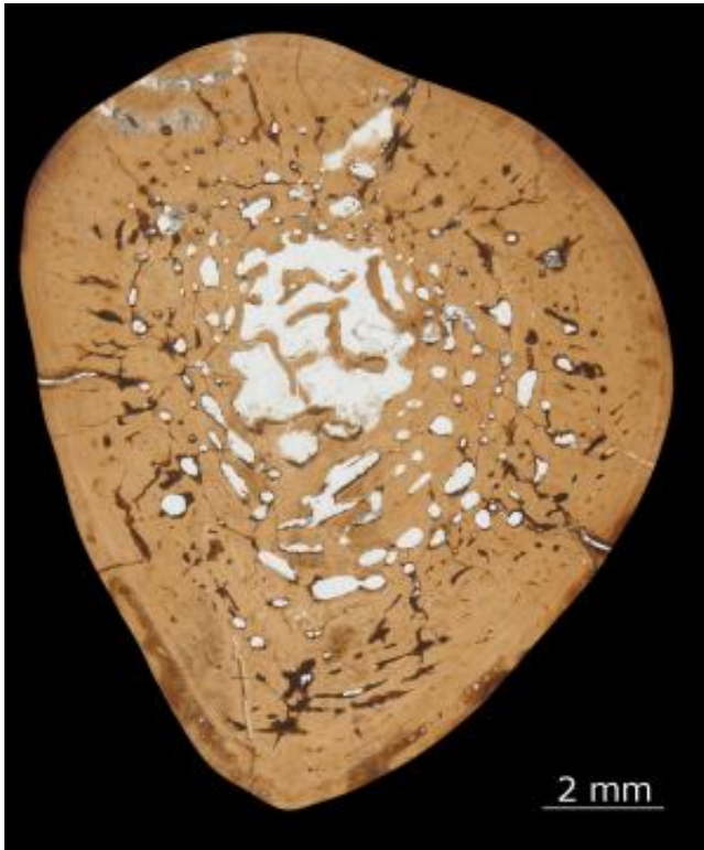
This image shows microanatomy of the midshaft of Metoposaurus femur.

Krasiejow, Poland was a vastly different place 230 million years ago during the Triassic Period. It was part of a giant continent called Pangea, had a warm climate throughout the year, and was populated by giant amphibians that weighed half a ton and were 10 feet long. Metoposaurus diagnosticus was one of these giant amphibians, and its environment had only two seasons: wet and dry. Like modern amphibians, Metoposaurus needed water for its lifestyle, but the extremely long dry season in Triassic Krasiejów drove this species to burrow underground and go dormant when water was scarce.