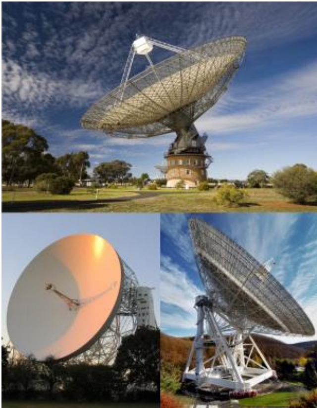
The three radio telescopes that were used to discover, to confirm or investigate the 24 pulsars: The Parkes radio telescope of the Australian research organization CSIRO (above), the Lovell telescope at the English Jodrell Bank Observatory (bottom left) and the 100-m radio telescope in Effelsberg, part of the Max Planck Institute for Radio Astronomy.

Together they combine to yield a sustained computing power of around 860 teraFLOPs per second. This places Einstein@Home on par with the world's fastest supercomputers. The analysis of the archival Parkes data was completed in eight months, while the same task would have taken a single CPU core more than 17,000 years.