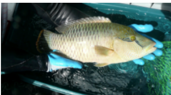
Researchers field-tested the model with fish at the spectacular Palmyra Atoll.