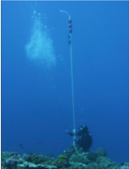
Underwater listening stations track acoustic data.

"Previous methods were not formulated with the fish, ocean and acoustics in mind," said Pedersen. "They therefore do not exploit all available information, such as the biology of the fish limiting its range of possible movement."