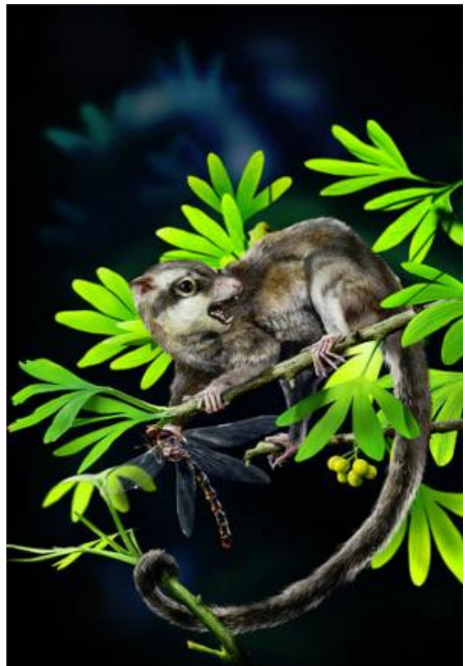
Fig.3 Reconstruction of Arboroharamiya jenkinsi . Credit: BI Shundong

"Although morphological characteristics support allotherians as a clade, Arboroharamiya shows again that homoplasy is a common phenomenon within Mesozoic mammals. Some features of Arboroharamiya , such as the reduced dentition shared with advanced multituberculates and elongated digits shared with more advanced arboreal mammals, must be convergences. On the other hand, the dentition with multiple premolars in Jurassic multituberculates has to be considered as reversed from the condition of Haramiyavia . Regardless of various phylogenetic scenarios involving allotherians, morphological convergences and/or reversals were common in the early stage of mammalian evolution ".