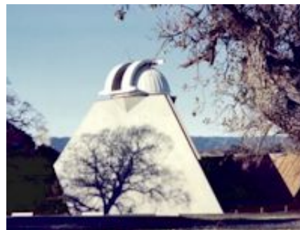
Astronomers at the Wilcox Solar Observatory (WSO) monitor the sun's global magnetic field on a daily basis.

When solar physicists talk about solar field reversals, their conversation often centers on the "current sheet." The current sheet is a sprawling surface jutting outward from the sun's equator where the sun's slowly-rotating magnetic field induces an electrical current. The current itself is small, only one ten-billionth of an amp per square meter ( 0.0000000001 amps/m 2 ), but there's a lot of it: the amperage flows through a region 10,000 km thick and billions of kilometers wide. Electrically speaking, the entire heliosphere is organized around this enormous sheet.