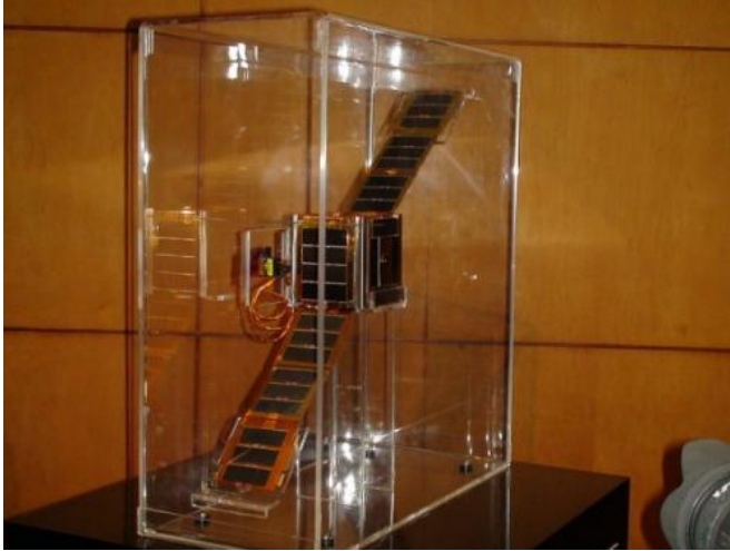
EE-01 Pegaso before deployment.

It's sometimes tough being a satellite in Earth orbit these days.