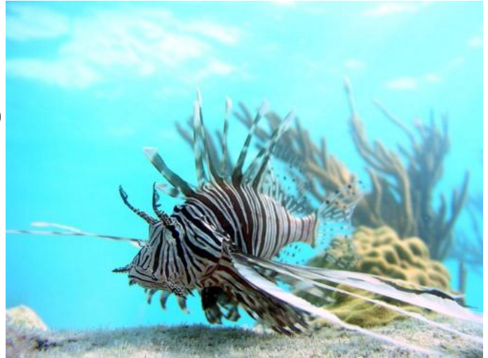
Lionfish have become an invasive species of enormous concern off the Atlantic Coast and in the Caribbean Sea.

Size does more than just increase predation. In many fish species, a large, mature adult can produce far more offspring than small, younger fish. A large, mature female in some species can produce up to 10 times as many offspring as a fish that's able to reproduce, but half the size.