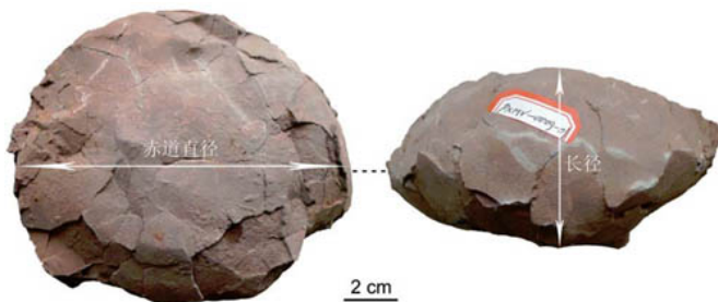
Fig. 1 Holotype of Parafaveoloolithus pingxiangensis oosp. nov.