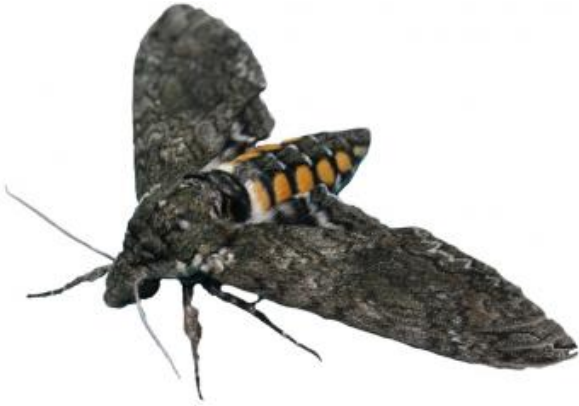
This is a Manduca sexta moth.