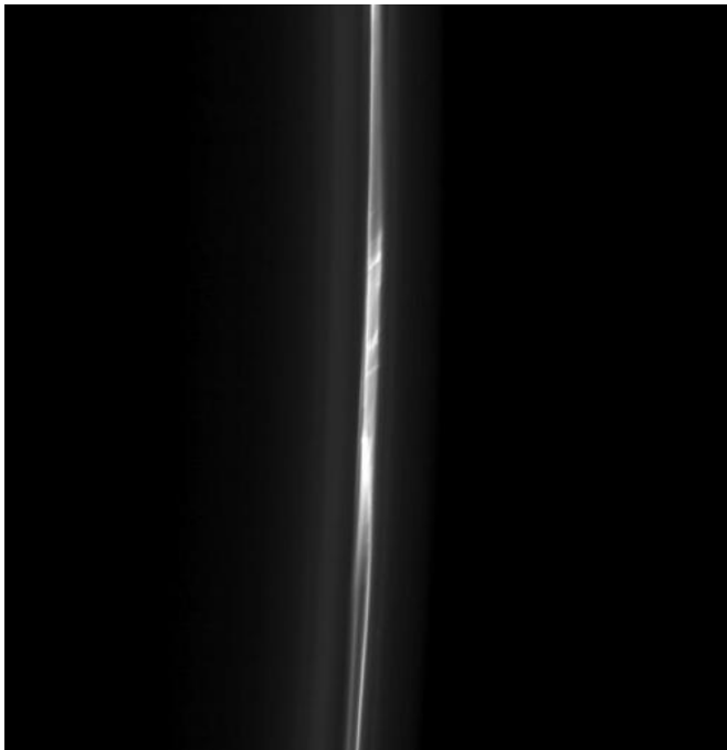
A ladder-like structure in Saturn's F ring seen by Cassini on Feb. 13, 2013.

Saturn's F ring is certainly a curious structure. Orbiting the giant planet 82,000 kilometers above its equatorial cloud tops, the F ring is a ropy, twisted belt of bright ice particles anywhere from 30-500 km wide. It can appear as a solid band or a series of braided cords surrounded by a misty haze, and often exhibits clumps and streamers created by the gravitational influence of embedded moonlets or passing shepherd moons.