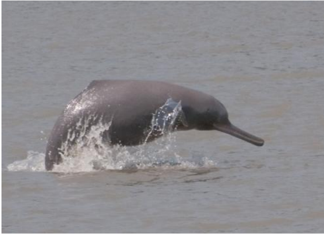
This image shows a rare sight of the fast and shy Ganges river dolphin.

(Phys.org) —Some thirty million years ago, Ganges river dolphins diverged from other toothed whales, making them one of the oldest species of aquatic mammals that use echolocation, or biosonar, to navigate and find food. This also makes them ideal subjects for scientists working to understand the evolution of echolocation among toothed whales.