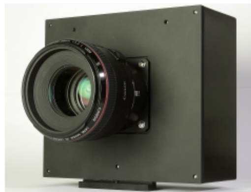
Prototype camera incorporating the newly developed 35 mm full-frame CMOS sensor.

perception as the naked eye, can capture magnitude-6 stars, Canon's newly developed CMOS sensor is capable of recording faint stars with a magnitude of 8.5 and above.