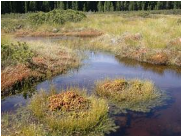
A set of biogeochemical feedbacks between soil microbes and vascular plants can explain the expansion of small shrubs in peatlands in response to climate warming.

Peatlands (bogs, turf moors) are among the most important ecosystems worldwide for the storage of atmospheric carbon and thus for containing the climate warming process. In the last 30 to 50 years the peat (Sphagnum) mosses, whose decay produces the peat (turf), have come under pressure by vascular plants, mostly small shrubs.