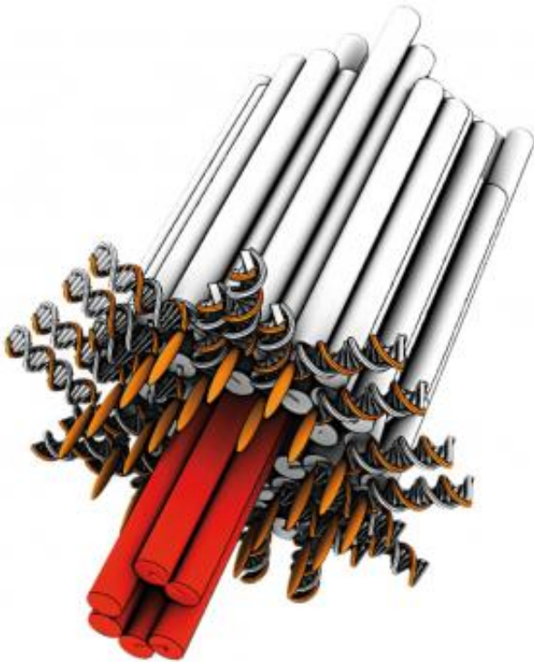
Scheme of a DNA-origami based ion channel.

(Phys.org)—Researchers in Germany and the US have used scaffolded DNA origami techniques to create ion channels or pores that span and penetrate lipid membranes and mimic natural ion channels.