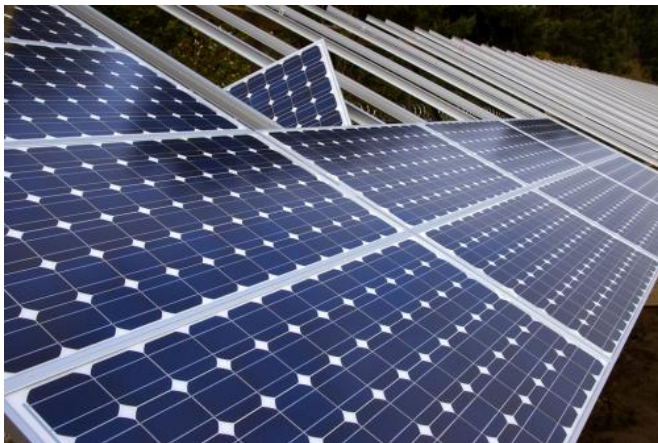
A solar panel array is installed in Oregon. Researchers have received support via the federal SunShot Initiative to study solar panel technologies at SLAC.

(Phys.org)—SLAC's Stanford Synchrotron Radiation Lightsource will play a central role in three research projects that seek cheaper materials and manufacturing techniques for solar panels, with support from a Department of Energy program called the SunShot Initiative .