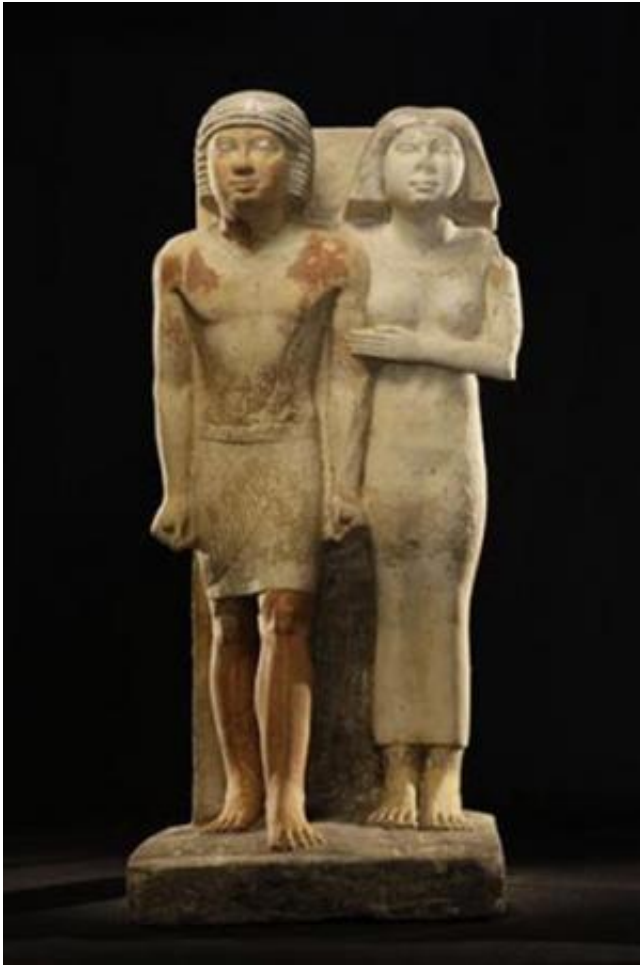
This Oct. 11, 2012 photo released Friday, Nov. 2, 2012 by Egypt's Supreme Council of Antiquities, shows recently discovered statues found in a complex of tombs, including one of a pharaonic princess, in the Abusir region, south of Cairo, Egypt. Egyptian Minister of Antiquities, Mohammed Ibrahim said Czech archaeologists have unearthed the tomb of Shert Nebti's, a pharaonic princess, daughter of King Men Salbo, dating from the fifth dynasty (around 2500 BC) along with four other tombs of "high ranking officials."

"She is the daughter of the king, but only her tomb is there, surrounded by the four officials, so the question is, are we going to discover other tombs around hers in the near future? We don't know anything about her father, the king, or her mother, but hope that future discoveries will answer these questions," El-Bialy said.