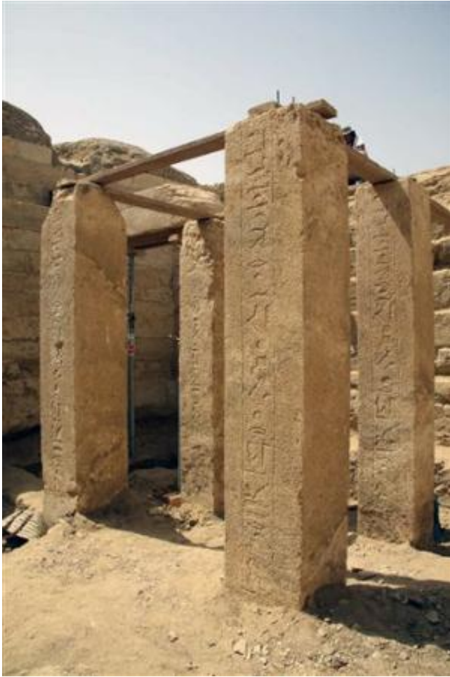
This undated image released Friday, Nov. 2, 2012 by Egypt's Supreme Council of Antiquities, shows four limestone columns with hieroglyphic inscriptions in the recently discovered antechamber of the tomb of a pharaonic princess in the Abusir region, south of Cairo, Egypt. Egyptian Minister of Antiquities, Mohammed Ibrahim said Czech archaeologists have unearthed the tomb of Shert Nebti's, a pharaonic princess, daughter of King Men Salbo, dating from the fifth dynasty (around 2500 BC) along with four other tombs of "high ranking officials."

The Czech team's discovery marks the "start of a new chapter" in the history of the burial sites of Abu Sir and Saqqara, Ibrahim added.