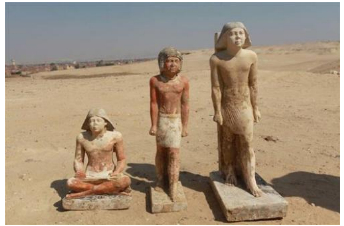
This undated image released Friday, Nov. 2, 2012 by Egypt's Supreme Council of Antiquities, shows three recently discovered statues found in a complex of tombs, including one of a pharaonic princess, in the Abusir region, south of Cairo, Egypt. Egyptian Minister of Antiquities, Mohammed Ibrahim said Czech archaeologists have unearthed the tomb of Shert Nebti's, a pharaonic princess, daughter of King Men Salbo, dating from the fifth dynasty (around 2500 BC) along with four other tombs of "high ranking officials."

The archaeologists working at the site are from the Czech Institute of Egyptology, which is funded by the Charles University of Prague. Their excavation began this month.