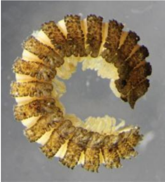
This image shows a Nephopyrgodesmus eungella male, one of the newly found species.

An entire group of millipedes previously unknown in Australia has been discovered by a specialist – on museum shelves. Hundreds of tiny specimens of the widespread tropical family Pyrgodesmidae have been found among bulk samples in two museums, showing that native pyrgodesmids are not only widespread in Australia's tropical and subtropical forests, but are also abundant and diverse. The study has been published in the open access journal ZooKeys .