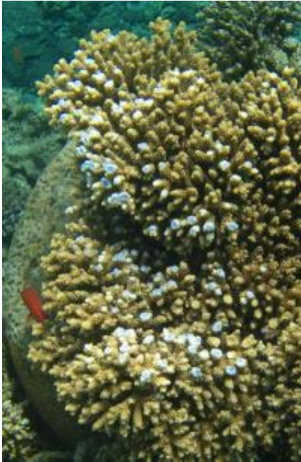
Red Sea Acropora coral shows blue colors in response to mechanical damage.

Research from the University of Southampton and National Oceanography, Southampton has provided new insight into the basic immune response and repair mechanisms of corals to disease and changing environmental conditions.