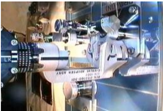
RRM's Multifunction Tool with its T-Valve Adapter closes in to retrieve the T-Valve on the RRM module.