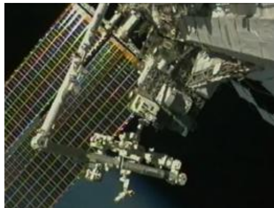
RRM (center, on platform) uses Canadarm2 and the Canadian Dextre robot (left and bottom, foreground) to demonstrate satellite-servicing tasks.

Satellite-servicing capabilities function like a reliable toolkit to help humans build, repair, and maintain critical space assets. Repair and refueling technologies similar to the ones demonstrated by RRM could be used to extend the lifespan of existent satellites, support the assembly of large structures on orbit, and mitigate orbital debris, among other benefits. In turn, these advances could make spaceflight more efficient, sustainable, and cost effective.