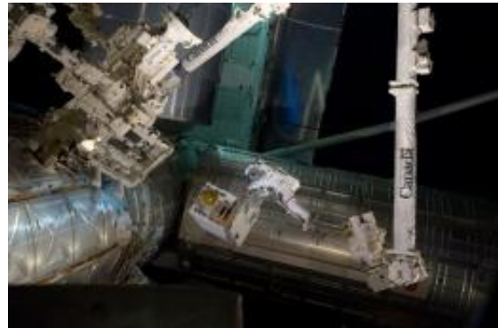
On July 12, 2011, spacewalking astronauts Mike Fossum and Ron Garan successfully transferred the Robotic Refueling Mission module from the Atlantis shuttle cargo bay to a temporary platform on the International Space Station's Dextre robot.

Dextre, the space station's twin-armed robotic "handyman," was developed by the CSA to perform delicate assembly and maintenance tasks on the station's exterior as an extension of its 57-foot-long (17.6 meter) robotic arm, Canadarm2. CSA wrote the software to control Dextre during RRM