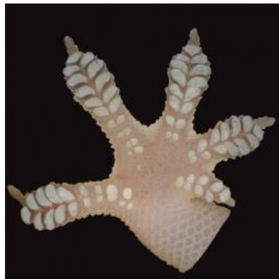
Photo of the underside of a foot of the house gecko ( Hemidactylus frenatus ) showing the expanded adhesive pads on the toes.

Geckos, a type of lizard, are found in tropical and semitropical regions around the world. About 60 percent of the approximately 1,400 gecko species have adhesive toepads. Remaining species lack the pads and are unable to climb smooth surfaces. Geckos with these toepads are able to exploit vertical habitats on rocks and boulders that many other kinds of lizards can't easily get to. This advantage gives them access to food in these environments, such as moths and spiders. Climbing also helps geckos avoid predators.