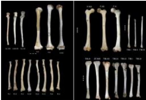
This image shows the upper and lower limb bones of those adults found in Sima de los Huesos, Atapuerca, Spain.

The reconstruction of 27 complete human limb bones found in Atapuerca (Burgos, Spain) has helped to determine the height of various species of the Pleistocene era. Homo heidelbergensis , like Neanderthals, were similar in height to the current population of the Mediterranean.