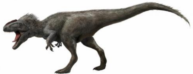
Artists' depiction of Yutyranus huali.

Much smaller dinosaurs with primitive feathers have been excavated in recent years, but this is the first direct sign of a huge, shaggy dinosaur. Scientists have long debated whether gigantic dinosaurs lost their feathers the bigger they got or were just not as extensively covered.