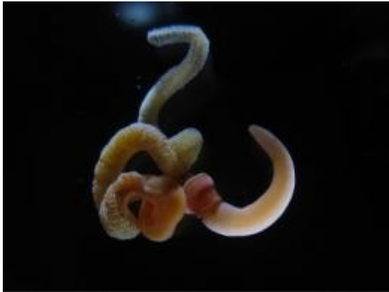
This is an adult acorn worm with its proboscis on the bottom right and tail on the top left.