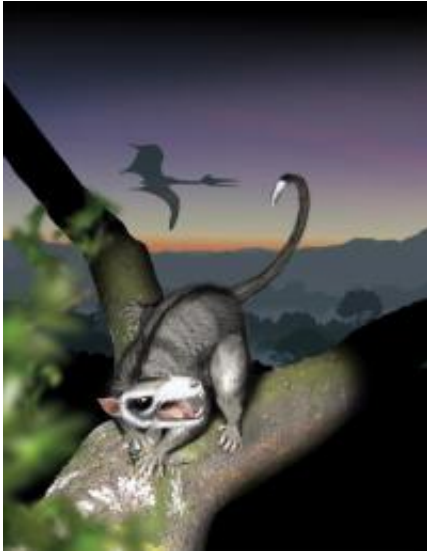
An artist's conception depicts a multituberculate in its natural habitat at the time of the dinosaurs. Credit: Jude Swales/Burke Museum of Natural History and Culture

Conventional wisdom holds that during the Mesozoic Era, mammals were small creatures that held on at life's edges. But at least one mammal group, rodent-like creatures called multituberculates, actually flourished during the last 20 million years of the dinosaurs' reign and survived their extinction 66 million years ago.