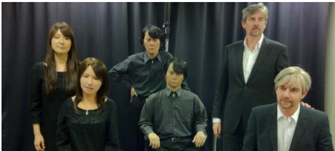
Geminoid Research.