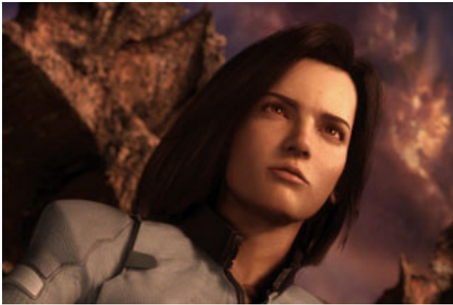
Final Fantasy image.

artificial intelligence - work that has resulted in numerous publications, patents, and awards from the National Science Foundation, Sloan Foundation, Packard Foundation, Electronic Arts, Microsoft, Google, U.S. Navy, U.S. Air Force, and other sources - he has a visually demonstrable take on the uncanny valley.