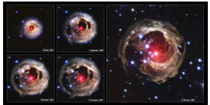
V838 Mon

The reflected light has its properties changed by the motion of the material off which it reflects. In particular, the light shows a notable blueshift, telling astronomers that the material itself is traveling 210 km/sec. This observation fits with theoretical predictions of eruptions similar to the type ? Carinae is thought to have undergone. However, the light echo has also highlighted some discrepancies between expectation and observation.