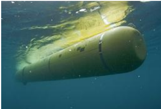
MBARI's seafloor-mapping AUV, the D. Allan B.

MBARI's seafloor mapping robot has had a busy year. It documented a huge lava flow from a three-month-old volcanic eruption off the Oregon coast; it charted mysterious three-kilometer-wide scour marks on the seafloor off Northern California; and it unearthed data that challenge existing theories about one of the largest offshore faults in Central California. MBARI researchers will describe these achievements, and others, in 10 different presentations at this week's meeting of the American Geophysical Union in San Francisco.