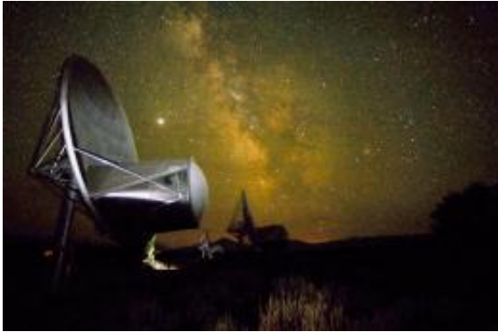
Allen Telescope Array.

Any intelligent extraterrestrial life that exists probably won't announce itself by blowing up the White House, or win over the hearts of children as a lovable alien with a glowing finger. Many scientists simply hope to find evidence of them by scanning the skies for a radio signal from a distant star's alien civilization. But such efforts may also risk overlooking clues of past alien activity right here on Earth.