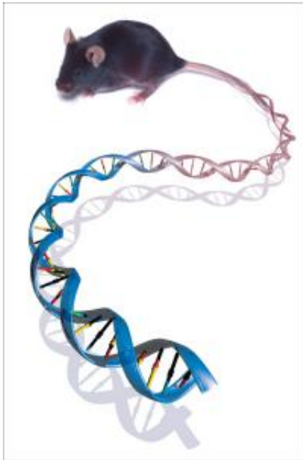
Mouse and DNA. A mouse's tail that transforms into a strand of DNA.

Just as Earth sends out robotic explorers, an alien civilization could have left behind dormant probes at strategic locations such as in the asteroid belt. Earth astronomers could try searching for such probes or even beaming "hello" radio messages to suspected locations in an attempt to "wake up" the probes.