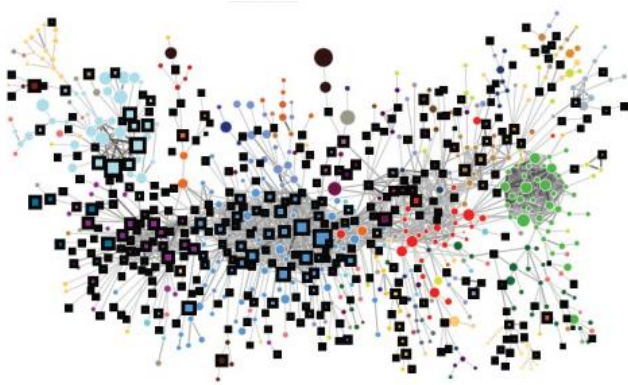
This network shows the product space of the US.

"The amount of knowledge that is required to make a product can vary enormously from one good to the next," the authors write. "Most modern products require more knowledge than what a single person can hold. Nobody in this world, not even the savviest geek nor the most knowledgeable entrepreneur, knows how to make a computer. He has to rely on others who know about battery technology, liquid crystals, microprocessor design, software development, metallurgy, milling, lean manufacturing and human resource management, among many other skills. That is why the average worker in a rich country works in a firm that is much larger and more connected than firms in poor countries."