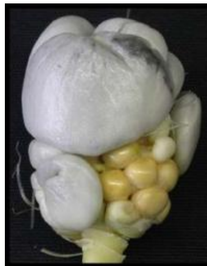
Maize cob infected with Ustilago maydis .

Cmu1 is a component of the shikimate metabolic pathway, through which cells produce tyrosine and phenylalanine - essential amino acids for humans and animals - from the starting material chorismate. Salicylic acid, which plays an important role in the defence against pathogens in plants, is also formed from chorismate. The Marburg-based researchers have now discovered that chorismate mutases, which have long been comprehensively studied, have an entirely new function in plant pathogens.