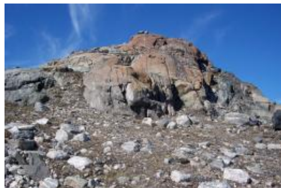
An outcrop of serpentinite from the Isua Supracrustal sequence of West Greenland, at the western margin of

The pH difference between the vent fluids and the ocean also could have provided an important energy supply for early organisms. When serpentinite is oxidized by seawater, hydrogen is formed. Microbes can react hydrogen with carbon dioxide to form methane or acetate, both of which serve as sources of chemical energy.