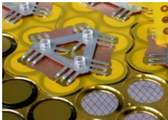
A collection of seven avalanche photodiodes, the sensors that detect instances of two-neutrino double-beta decay (as well as other decays), makes a spider, as shown at right. More than 40 spiders make up a detector.